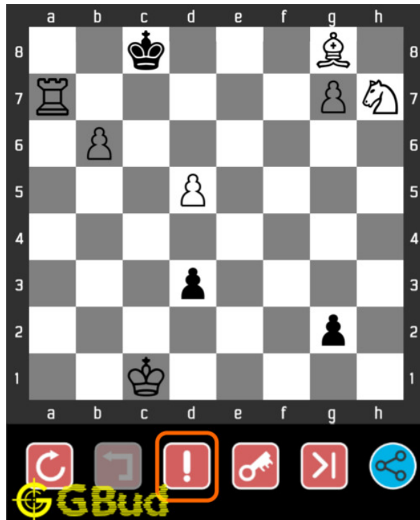
Figure 1.4: Click the help button to get help on next move @ https://gbud.in/gy9gdr2