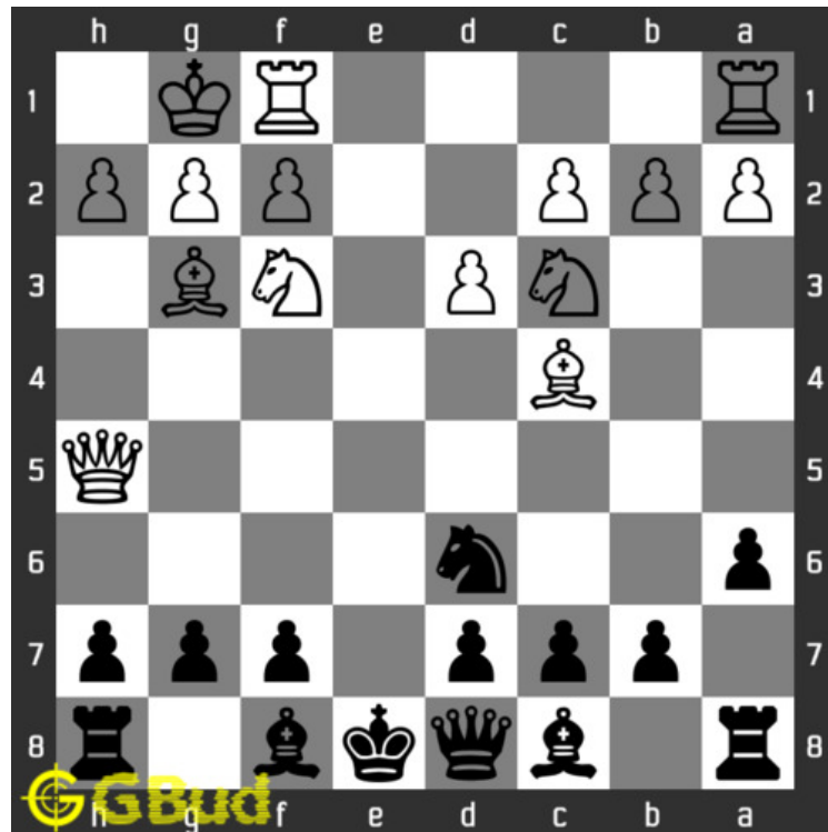
Figure 1.1: Solve this Medium chess puzzle 0004. Avoid check mate in one move @ https://gbud.in/gw8gcx2