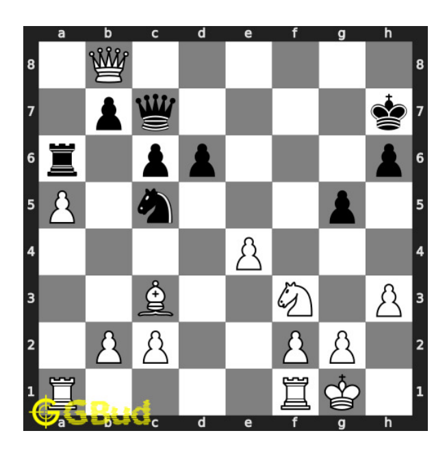
Figure 1: Solve this hard chess puzzle 0092. Mate in 4 moves @ https://gbud.in/glp69g3