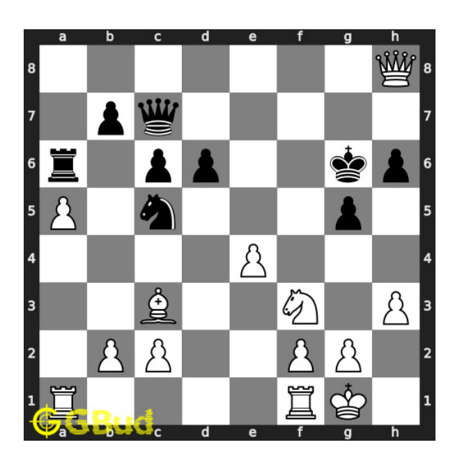
Figure 5: Kg6

opponent's king escapes from the check threat by moving to g6 as this is the only legal move available.