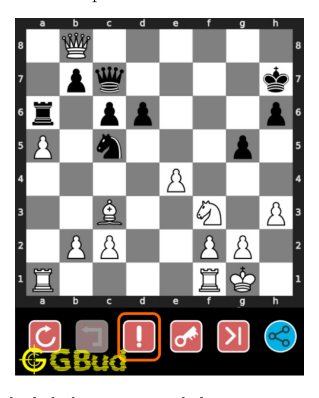
Figure 16: Click the help button to get help on next move @ https://gbud. in/glp69g3