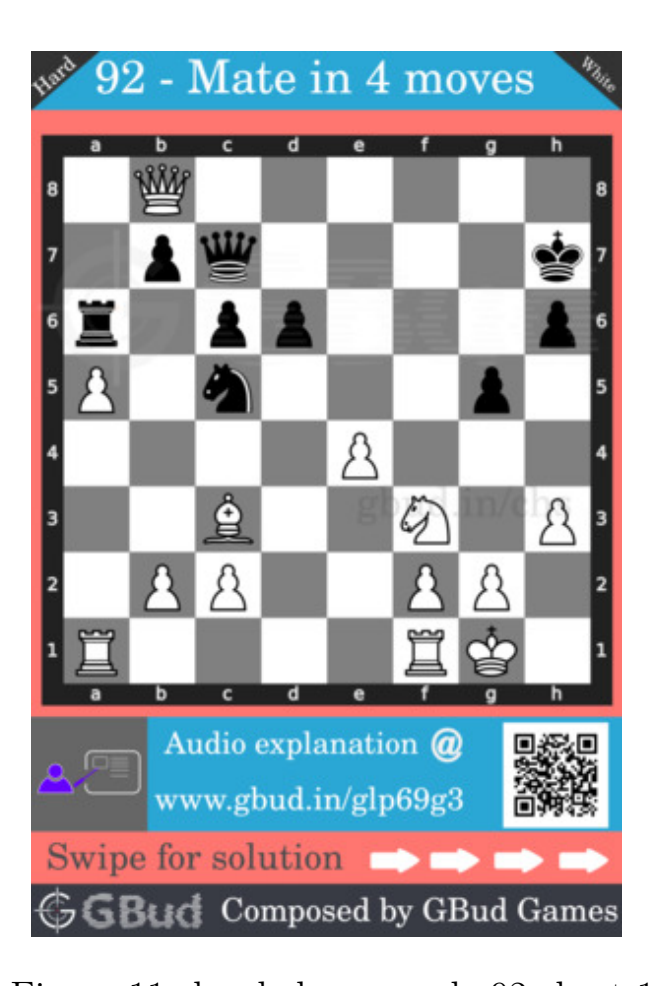
Figure 11: hard chess puzzle 92 chart 1