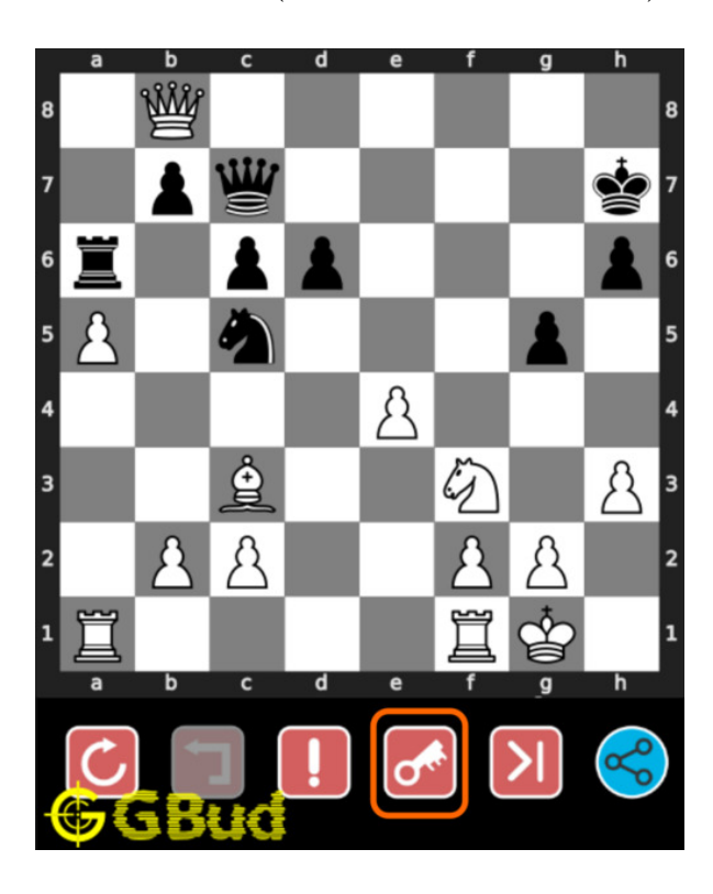
Figure 15: Click the solution button to view solutions @ https://gbud.in/glp69g3