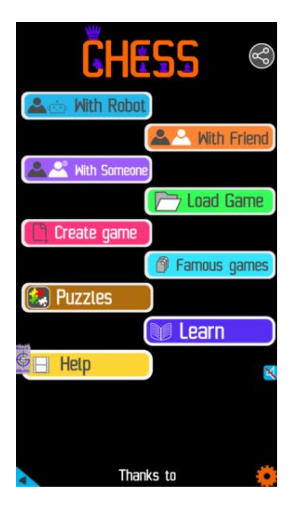
Figure 19: Play chess online for free. Solve puzzles and play with friends

Play chess for free at https://gbud.in/chs