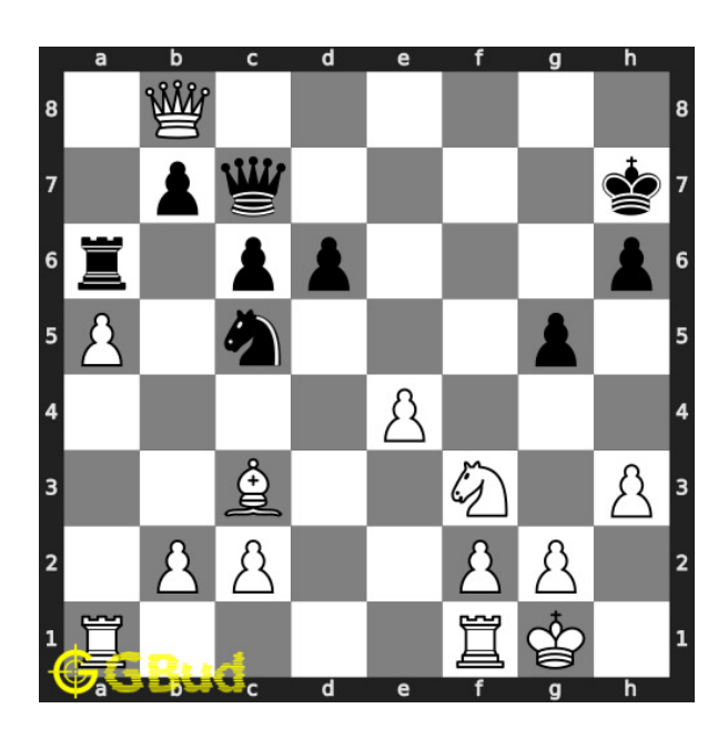
Figure 3: Initial board position of hard chess puzzle 0092

Initial board position This is the initial board position of hard chess puzzle 0092.