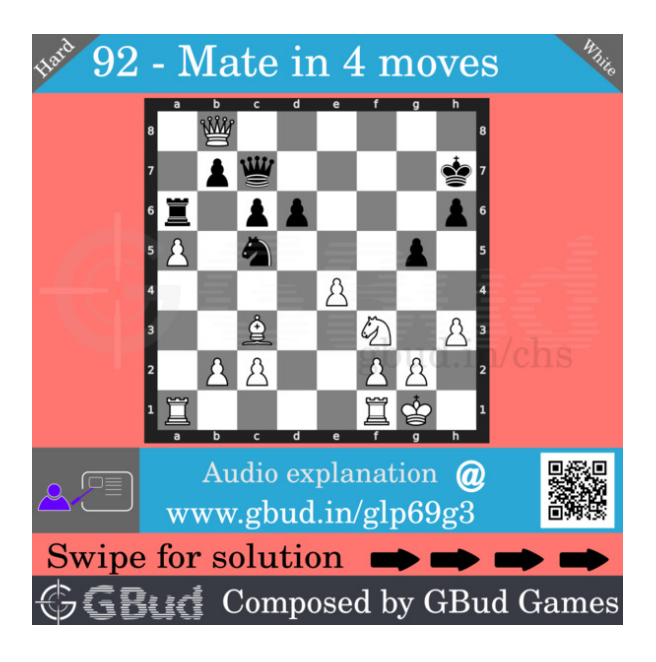
Figure 13: hard chess puzzle 92 chart 3