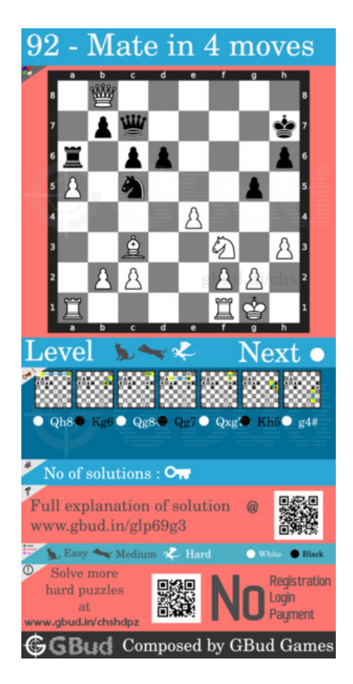
Figure 12: hard chess puzzle 92 chart 2