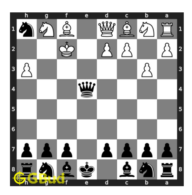
Figure 8: gxh1=N# - Your pawn promotes itself to a knight by capturing the rook. It is always not necessary to promote the pawn to a high value piece. You can some times under-promote the pawn. Opponent's king has no free squares. This is how you can mate in 3 moves