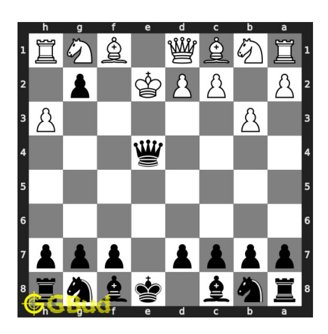
Figure 6: Qxe4+ - Your queen captures the pawn at e file and gives the next check.