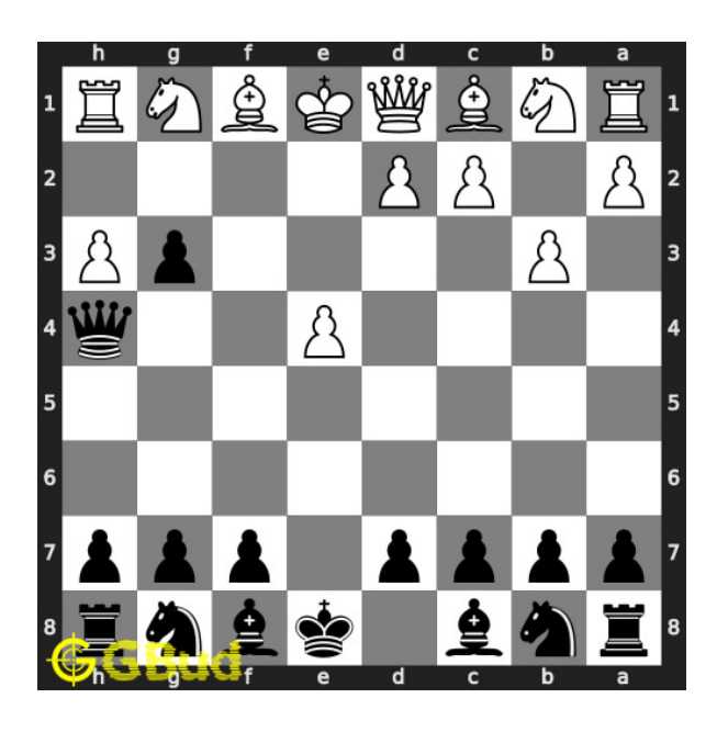
Figure 1: Solve this hard chess puzzle 0077. Mate in 3 moves @ https://gbud.in/gbjq8c3