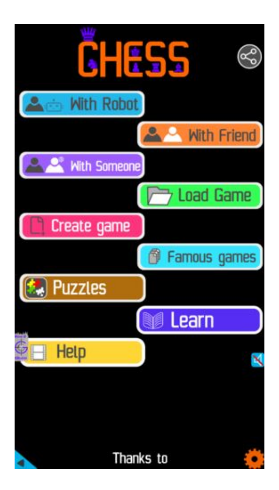
Figure 13: Play chess online for free. Solve puzzles and play with friends

Play chess for free at https://gbud.in/chs