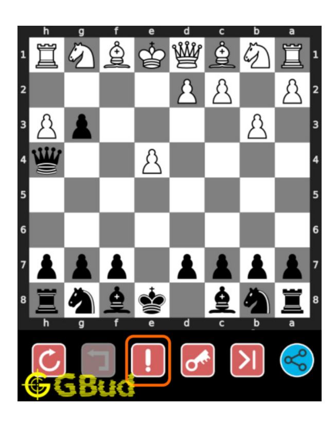
Figure 10: Click the help button to get help on next move @ https://gbud. in/gbjq8c3