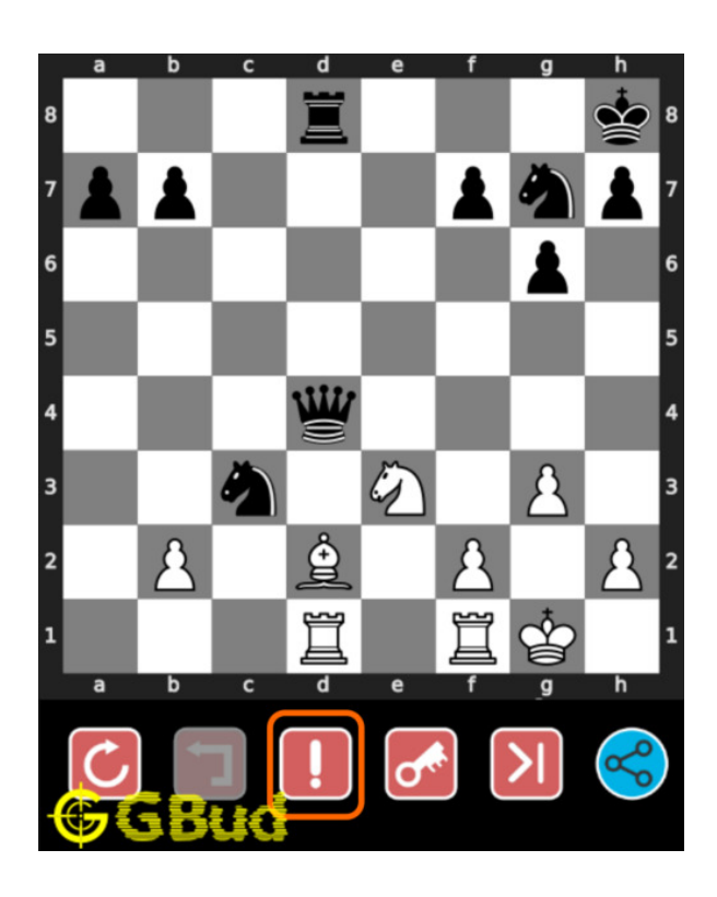
Figure 10: Click the help button to get help on next move @ https://gbud. in/g3fr713