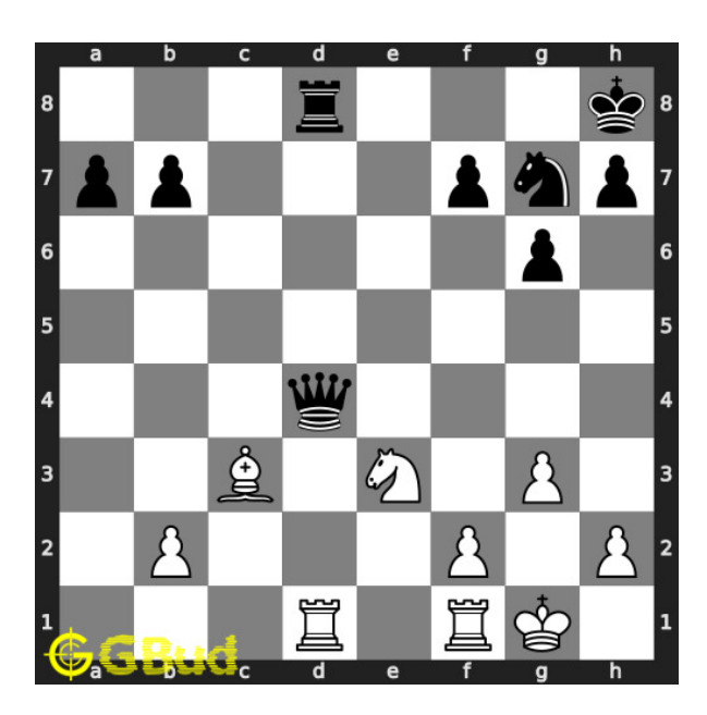
Figure 4: Bxc3 - Bishop is threatening the queen. If the queen moves, your bishop will pin the opponent's knight to their king. This is a form of skewer attack on the knight. This is also a discovered attack as the bishop movement opens your rook's x-ray attack on opponent's rook