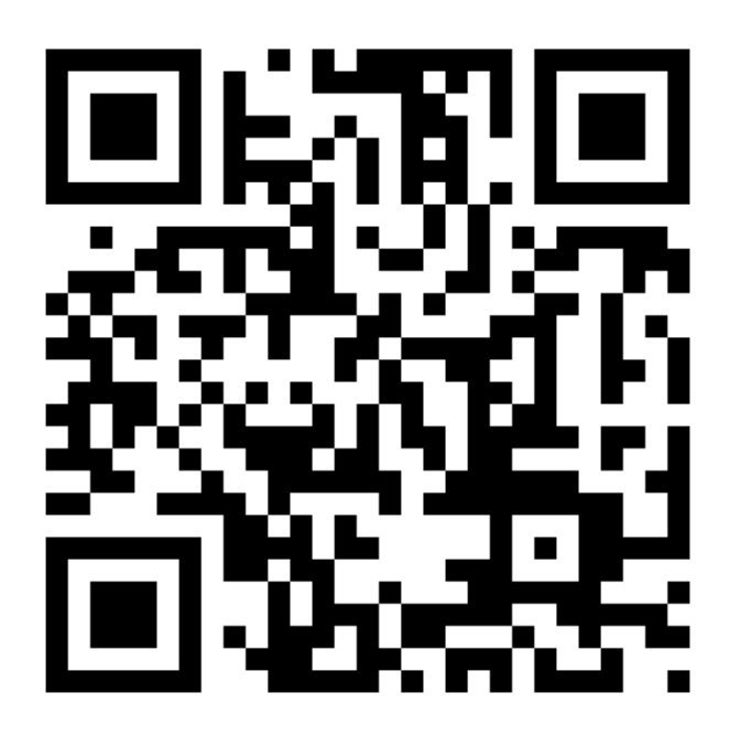
Figure 1.8: Solve this puzzle online by scanning this QR code or go to the link below