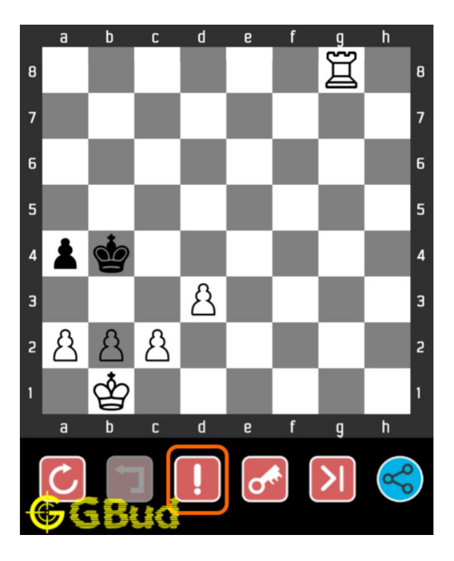
Figure 1.4: Click the help button to get help on next move @ https://gbud.in/gwf9vy3

Access the latest version of this article at https://gbud.in/blog/game/chess/hard-chess-puzzles/hard-chess-puzzle-0019.html