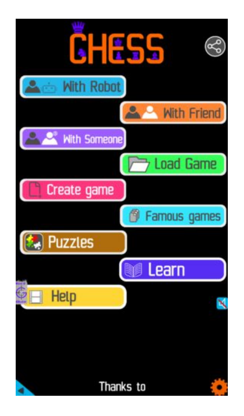
Figure 1.7: Play chess online for free. Solve puzzles and play with friends

Play chess for free at https://gbud.in/chs