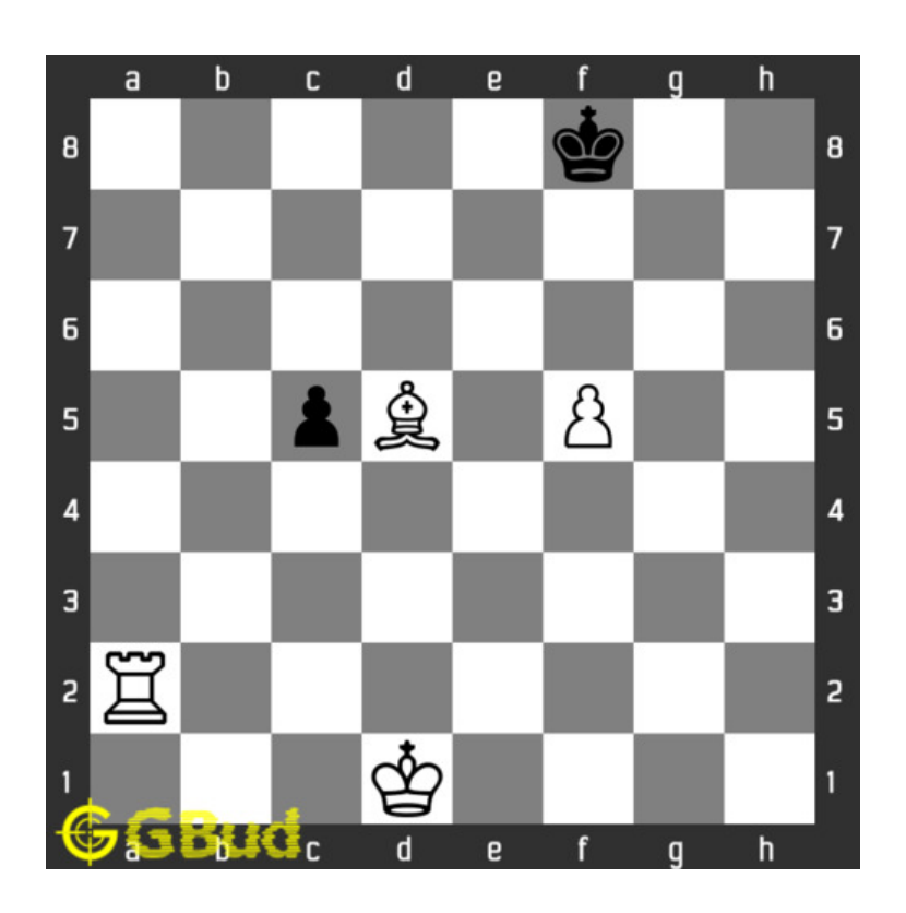
Figure 1.1: Solve this hard chess puzzle 0014. Mate in 3 moves @ https://gbud.in/glr5vl3