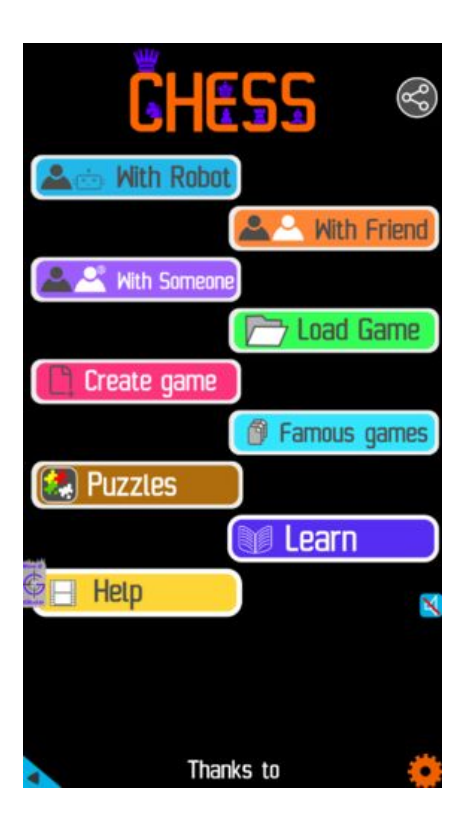
Figure 1.7: Play chess online for free. Solve puzzles and play with friends

Play chess for free at https://gbud.in/chs