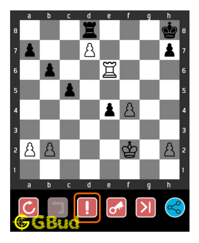
Figure 1.4: Click the help button to get help on next move @ https://gbud.in/gsbl203

Access the latest version of this article at https://gbud.in/blog/game/chess/hard-chess-puzzles/hard-chess-puzzle-0013.html