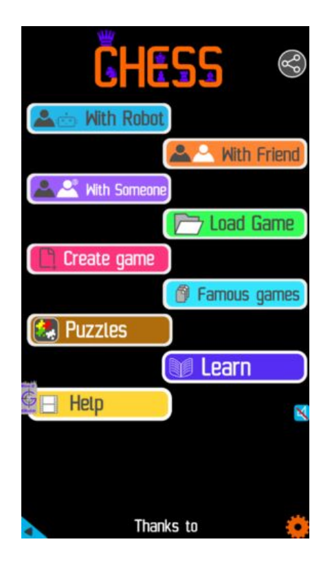
Figure 1.7: Play chess online for free. Solve puzzles and play with friends

Play chess for free at https://gbud.in/chs