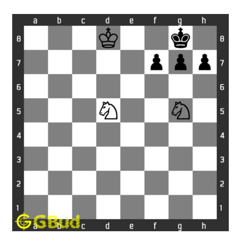
Figure 1.1: Solve this hard chess puzzle 0011. Mate in 2 moves @ https://gbud.in/g6lg9p3