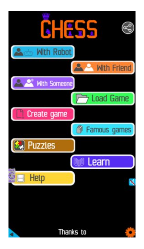
Figure 1.7: Play chess online for free. Solve puzzles and play with friends

Play chess for free at https://gbud.in/chs