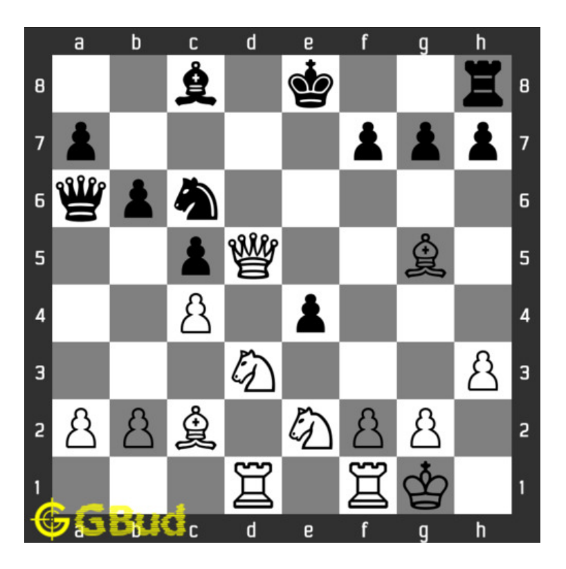
Figure 1.1: Solve this hard chess puzzle 0005. mate in 3 moves @ https://gbud.in/gvpz6s3