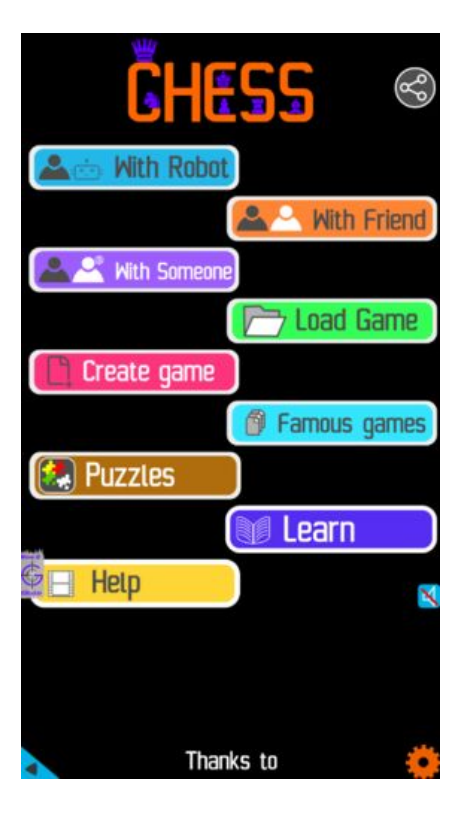
Figure 1.7: Play chess online for free. Solve puzzles and play with friends

Play chess for free at https://gbud.in/chs