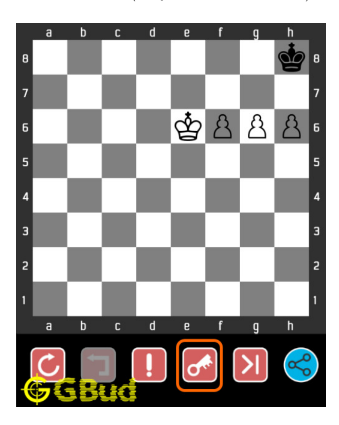
Figure 1.3: Click the solution button to view solutions @ https://gbud.in/g3phn23