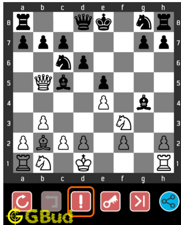
Figure 1.4: Click the help button to get help on next move @ https://gbud.in/gmddtjl