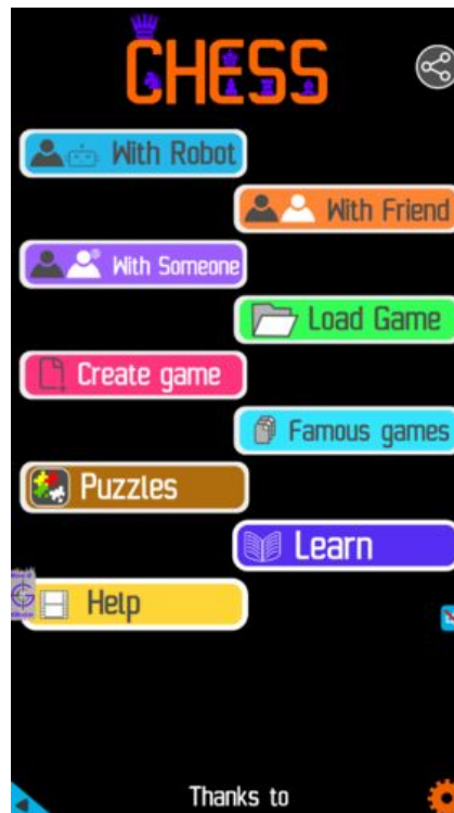
Figure 1.7: Play chess online for free. Solve puzzles and play with friends

Play chess for free at https://gbud.in/chs