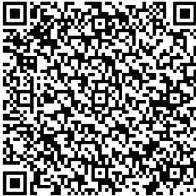
Figure 1.8: Solve this easy puzzle online by scanning this QR code or go to the link below