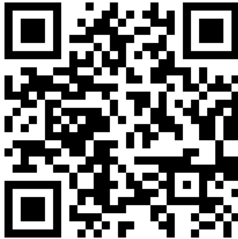
Figure 3: Solve these Knight puzzles 61 to 70 puzzles online or view solutions by scanning this QR code or goto the link below